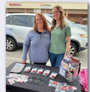
GiGi's Playhouse Blessings in a Backpack