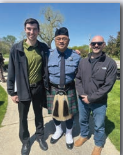
Fort Wayne Police Memorial Ceremony