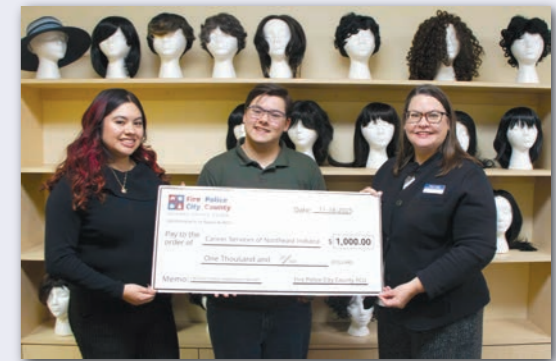
Cancer Services Donation

Summit Choice Credit Union remains grounded in our commitment to ignite wellness and transform lives by providing financial wellness for all.