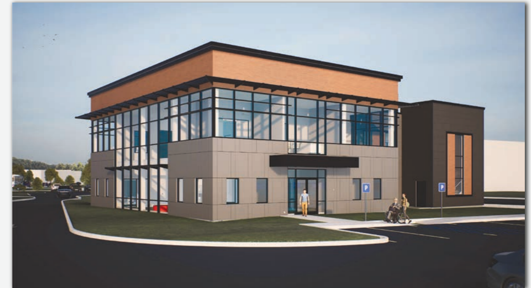
Our new headquarters is currently under construction, with opening planned for 2027.

In 2000, the name Fire Police City County FCU was adopted to honor the core groups that shaped our foundation. Since then, we have continued to grow, establishing more than 360 Select Employer Groups and extending membership to businesses, churches, volunteer organizations, and their family members throughout the community. Through economic uncertainty, community growth, and generational change, our commitment to people over profit has never wavered.